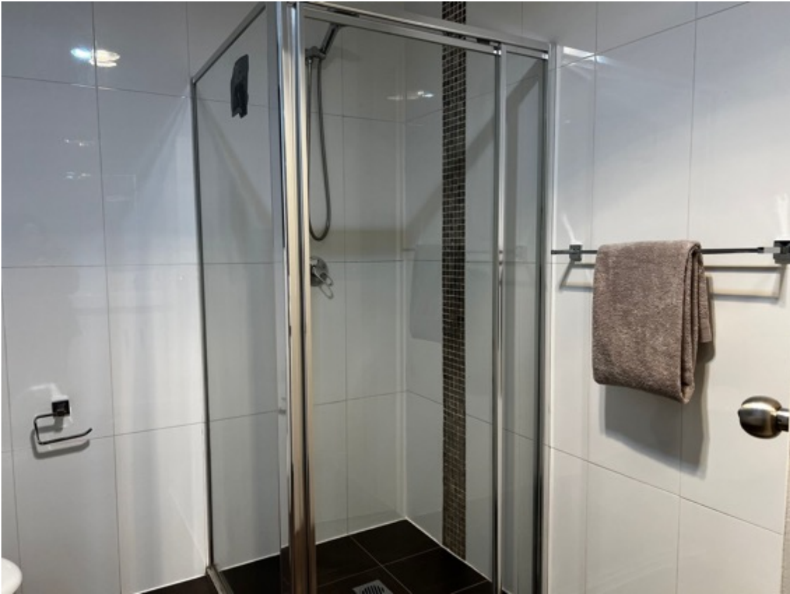
Hot and cold water services tested, functioned at the time of inspection.