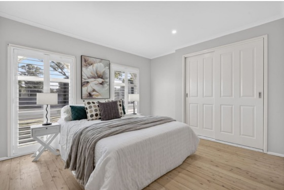
Interior bedroom areas present in serviceable condition for the age.