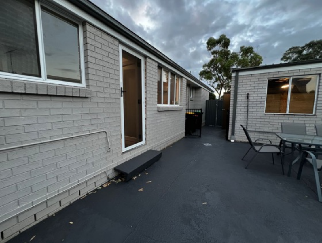
Rear elevation example above.