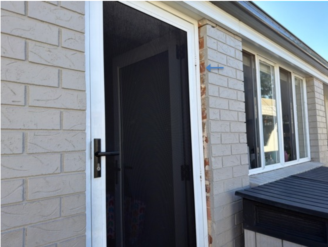
Storm moulds are missing around the perimeter wall.