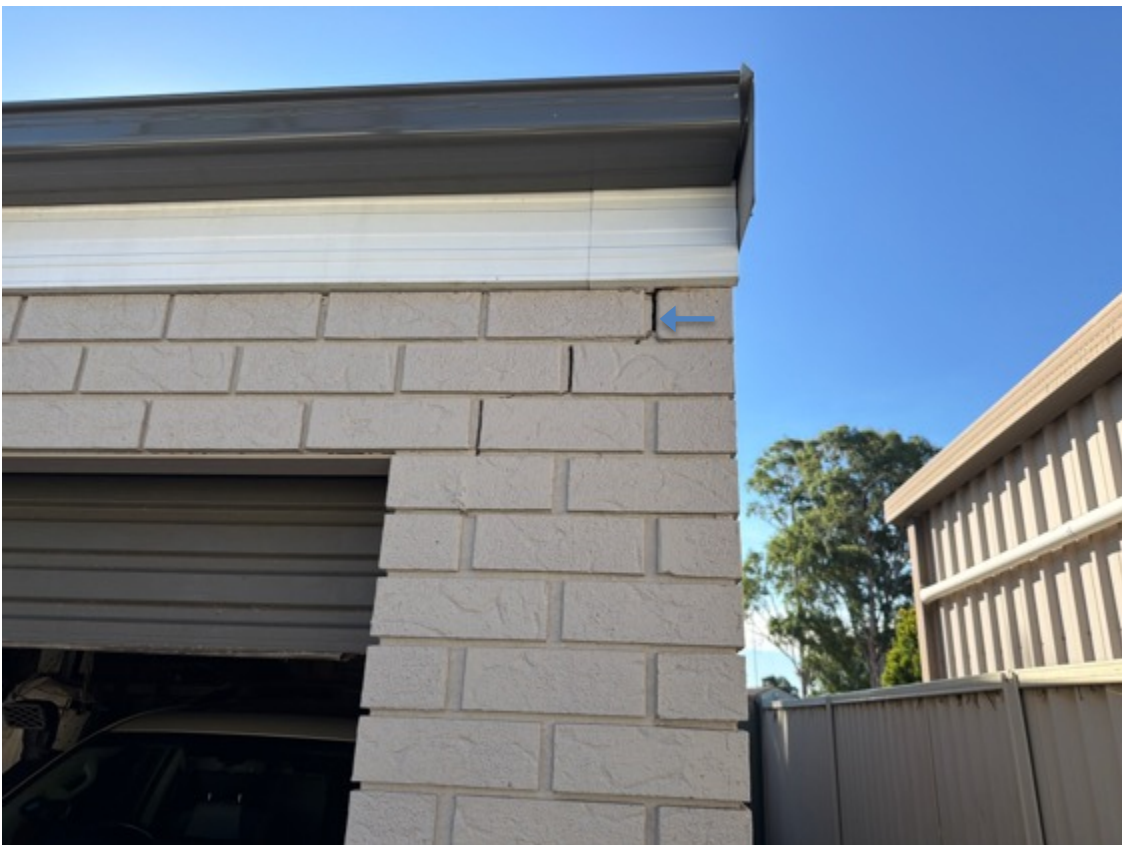
Example rear left of garage category three - five cracking above.