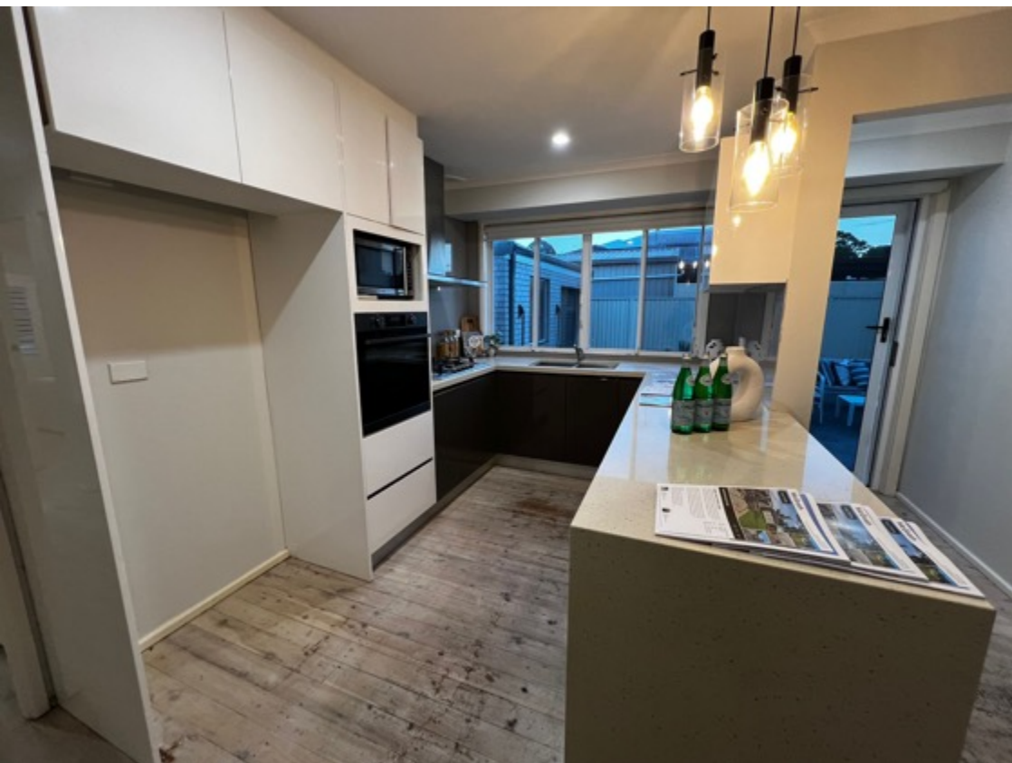
The kitchen area presents in serviceable condition for the age.