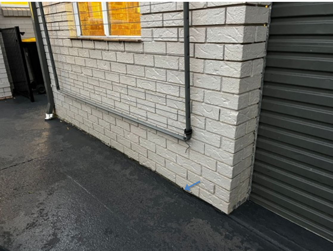
Sections of brickwork has an overhang (rear of garage example above.)