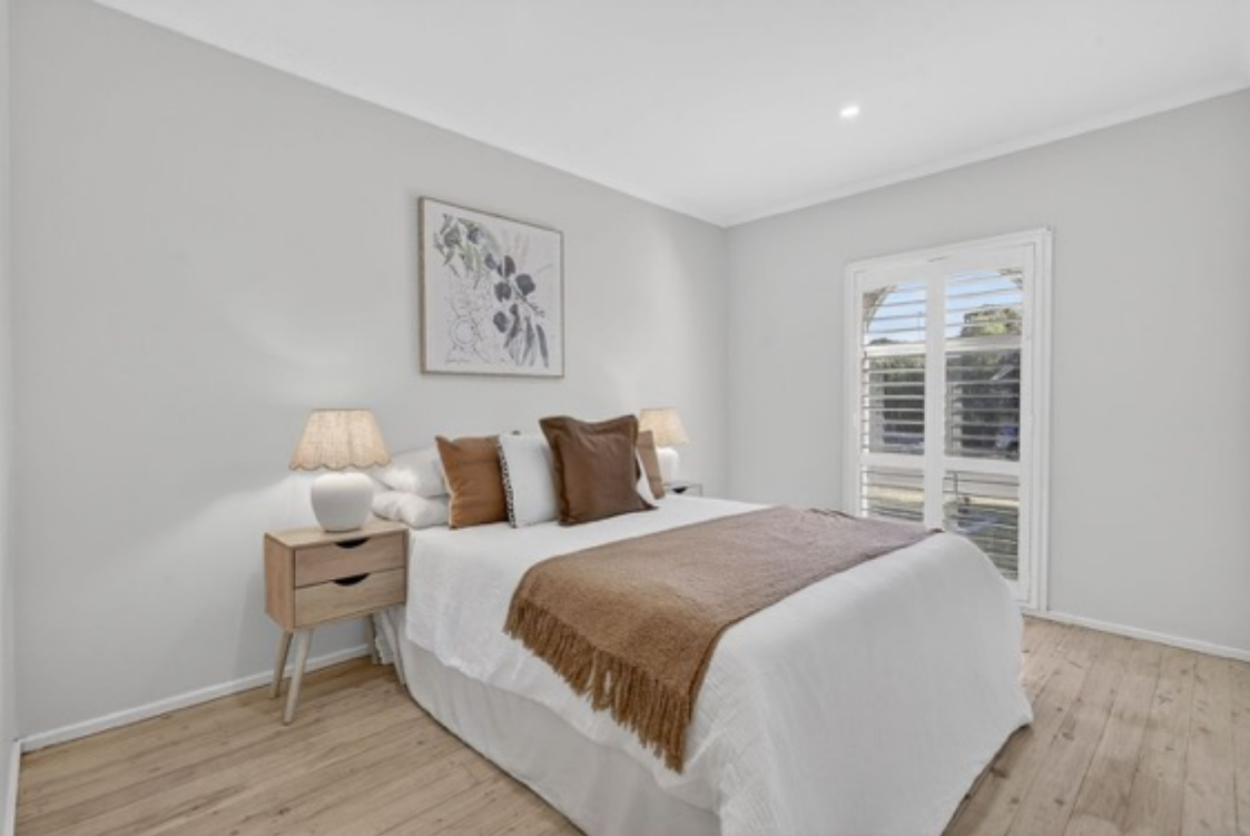
All interior lights tested, functioned as intended at the time of inspection.