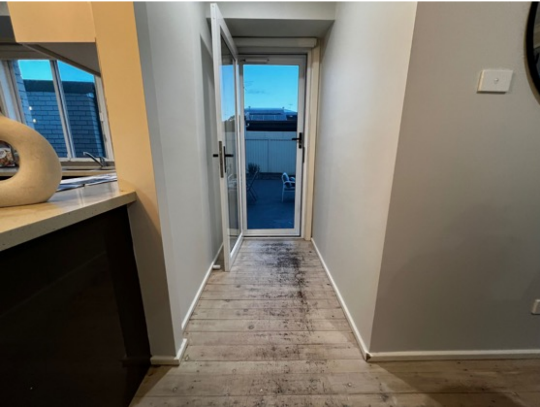
Internal floorboards display moderate to heavy signs of wear, consistent with age.