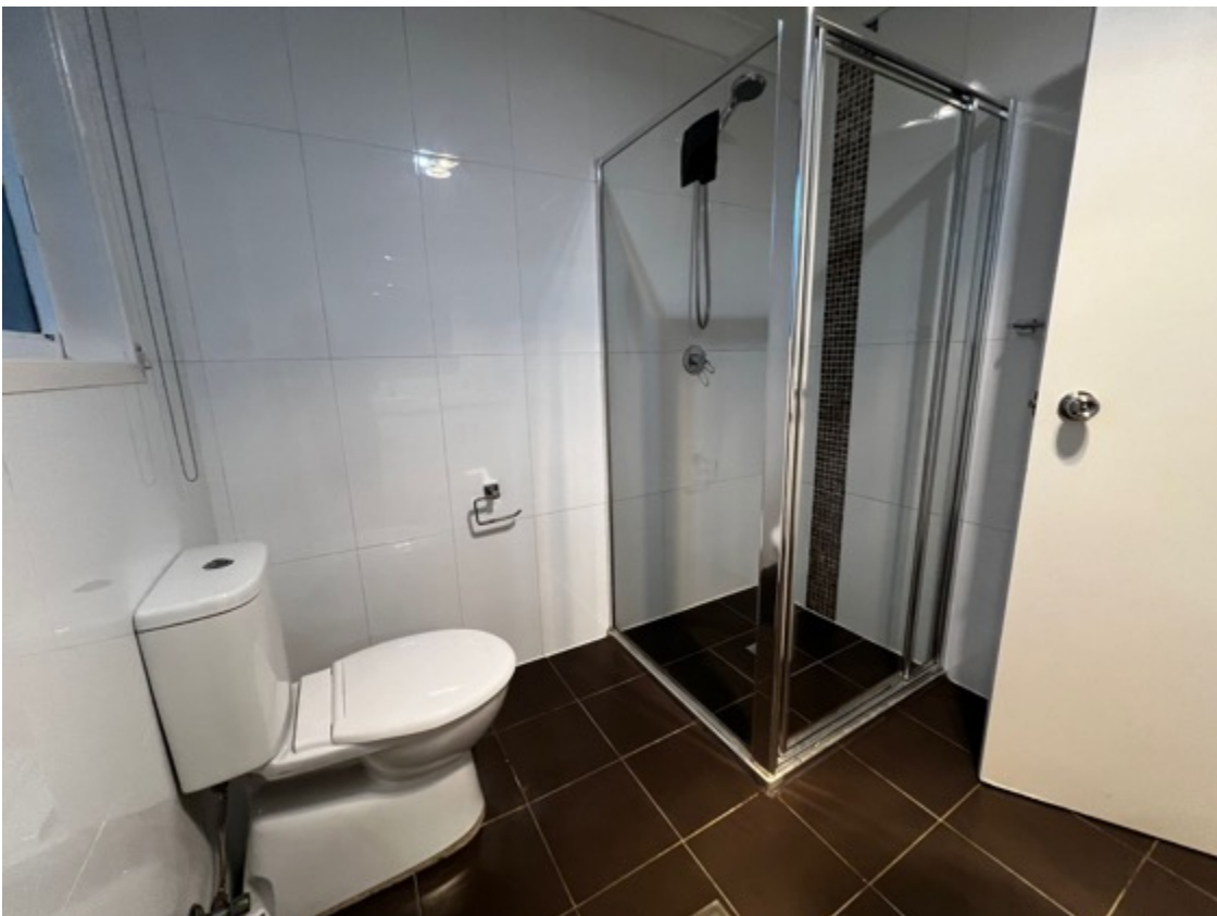
The common bathroom area tested for leaks, was issue free at the time of inspection.