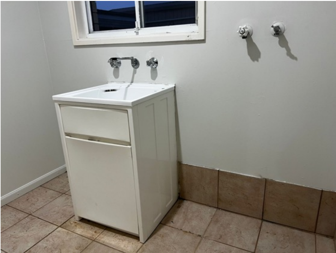
The laundry is in serviceable condition – sections of tile grout is darkened, reapplication is recommended.