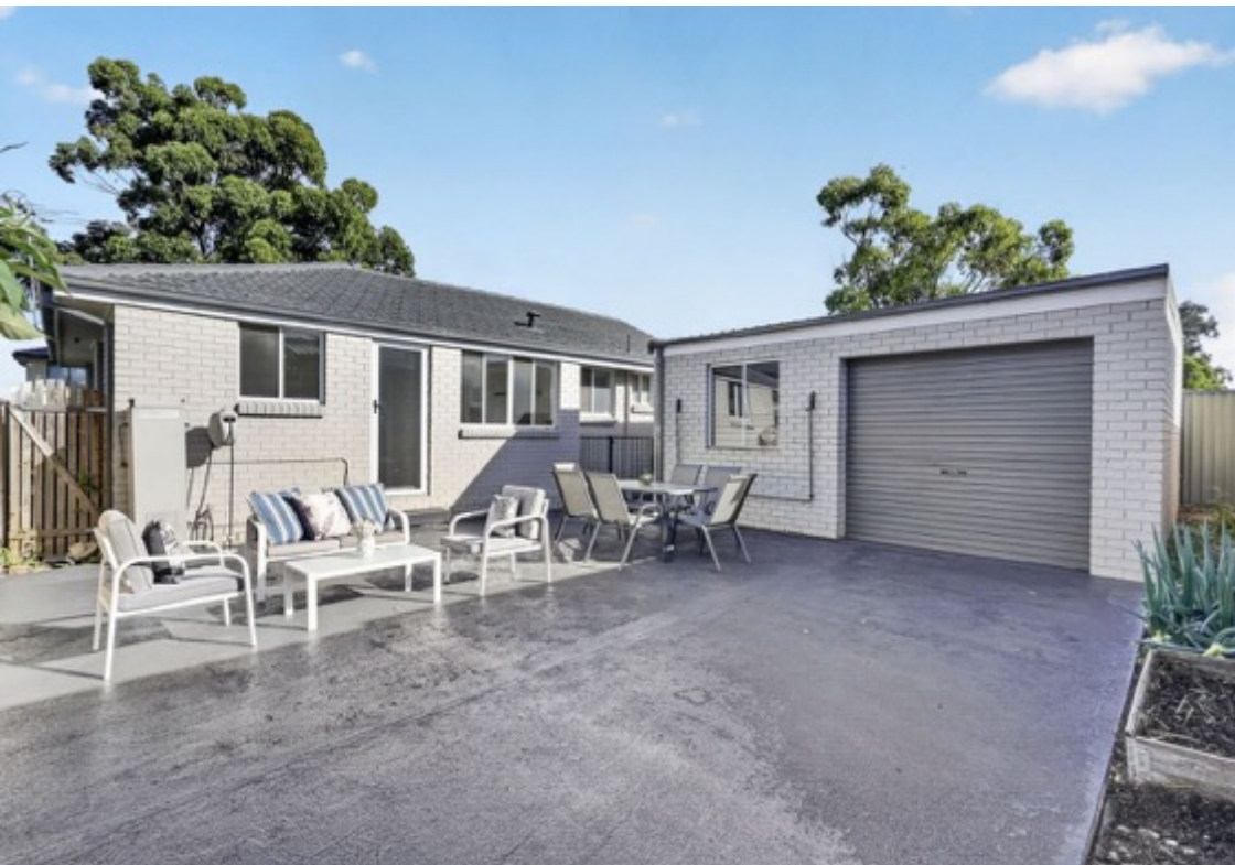
Example rear of garage example above.