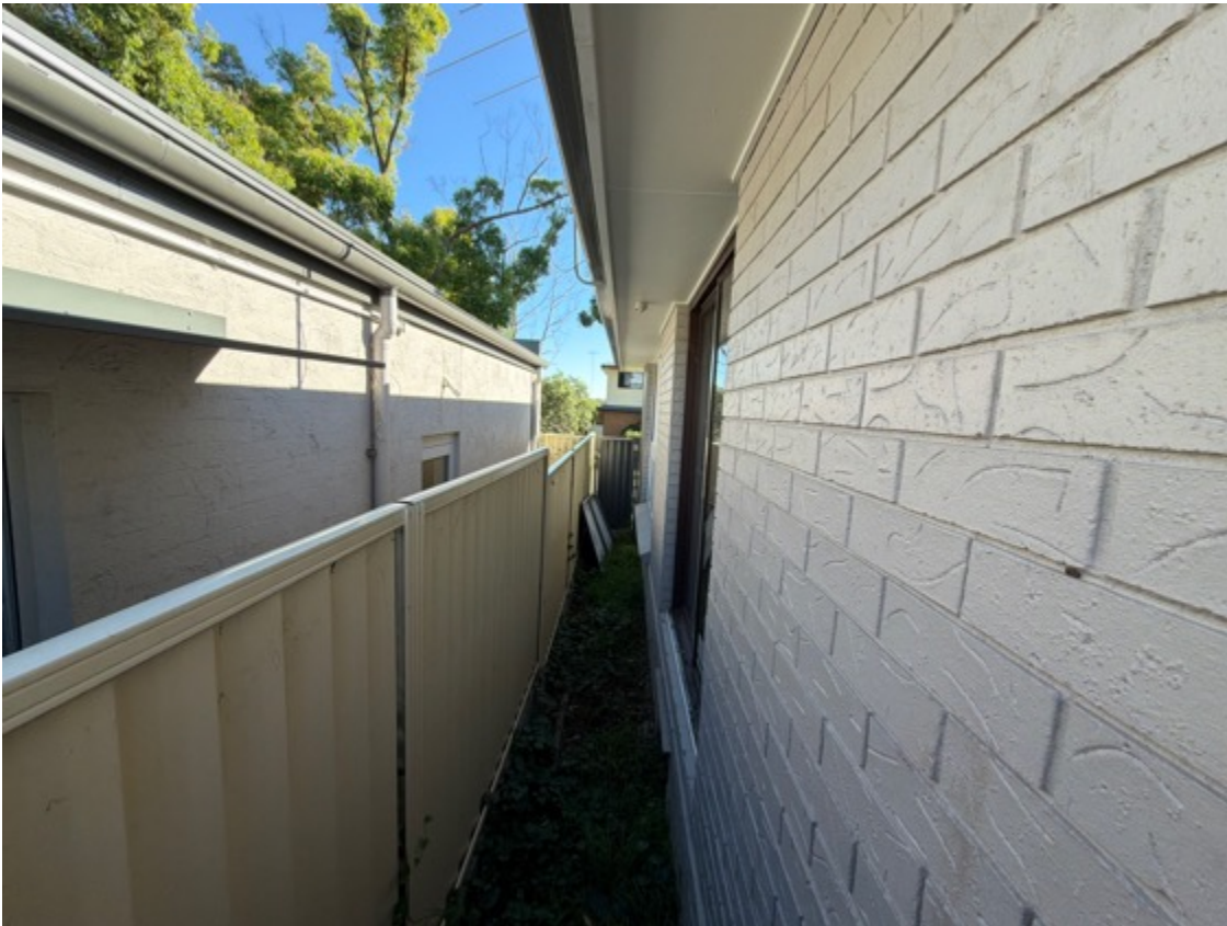
Site fences are in serviceable condition, isolated sections are dented - consistent with age.