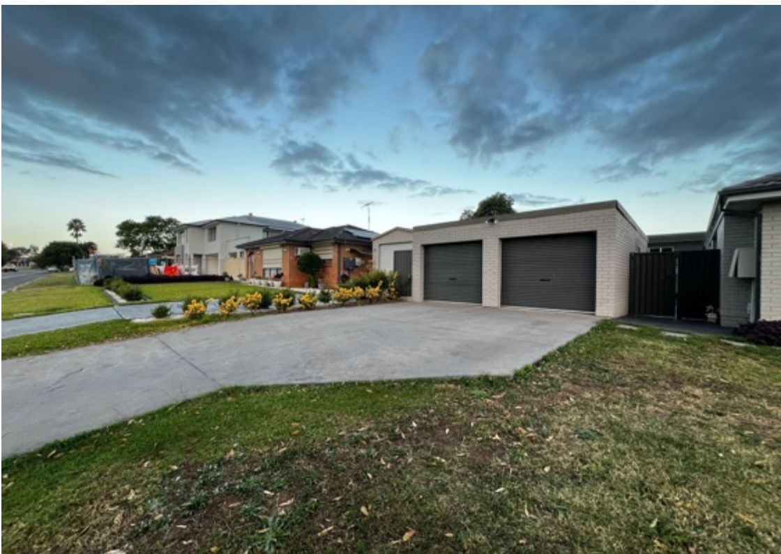
Exterior concrete presents in satisfactory condition for the age - isolated sections are cracked and undulating (consistent with age.)