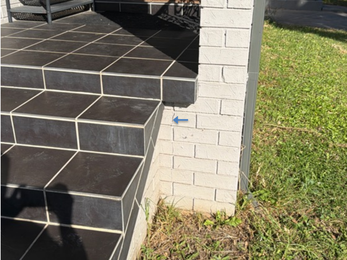
Isolated sections of external brickwork displays category cracking (front right side elevation example above.)