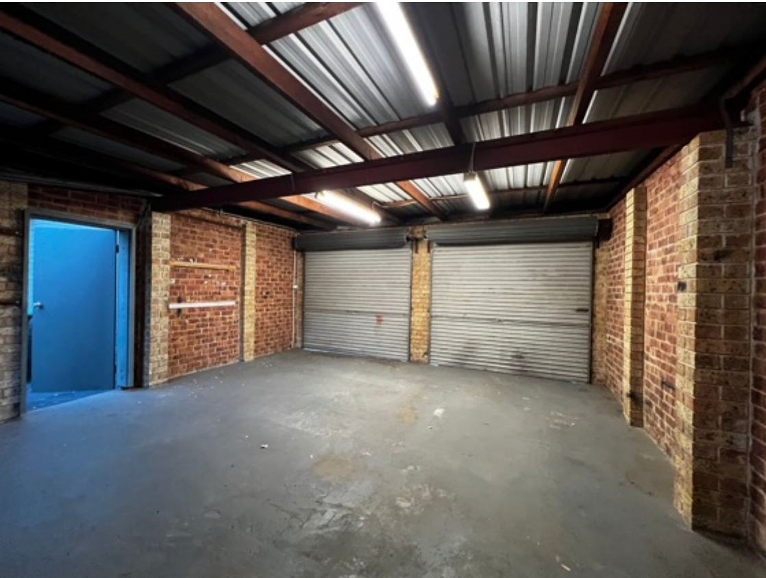
The garage interior is in serviceable condition.