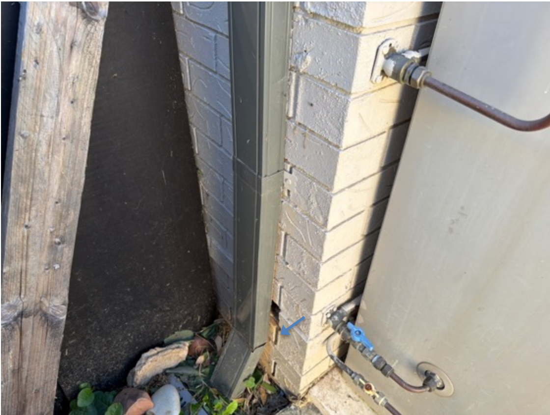
Rear right side elevation brickwork has category one cracking and isolated sections of bricks missing.