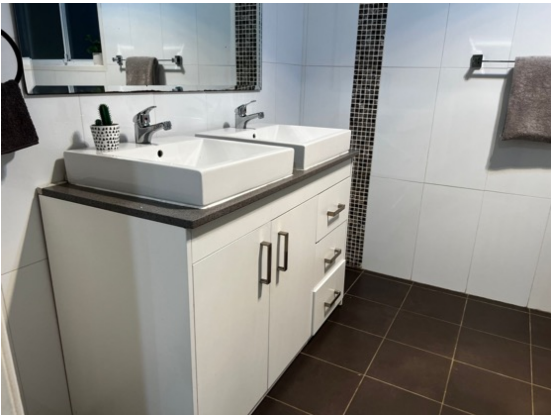
Water pressure tested, is sufficient.