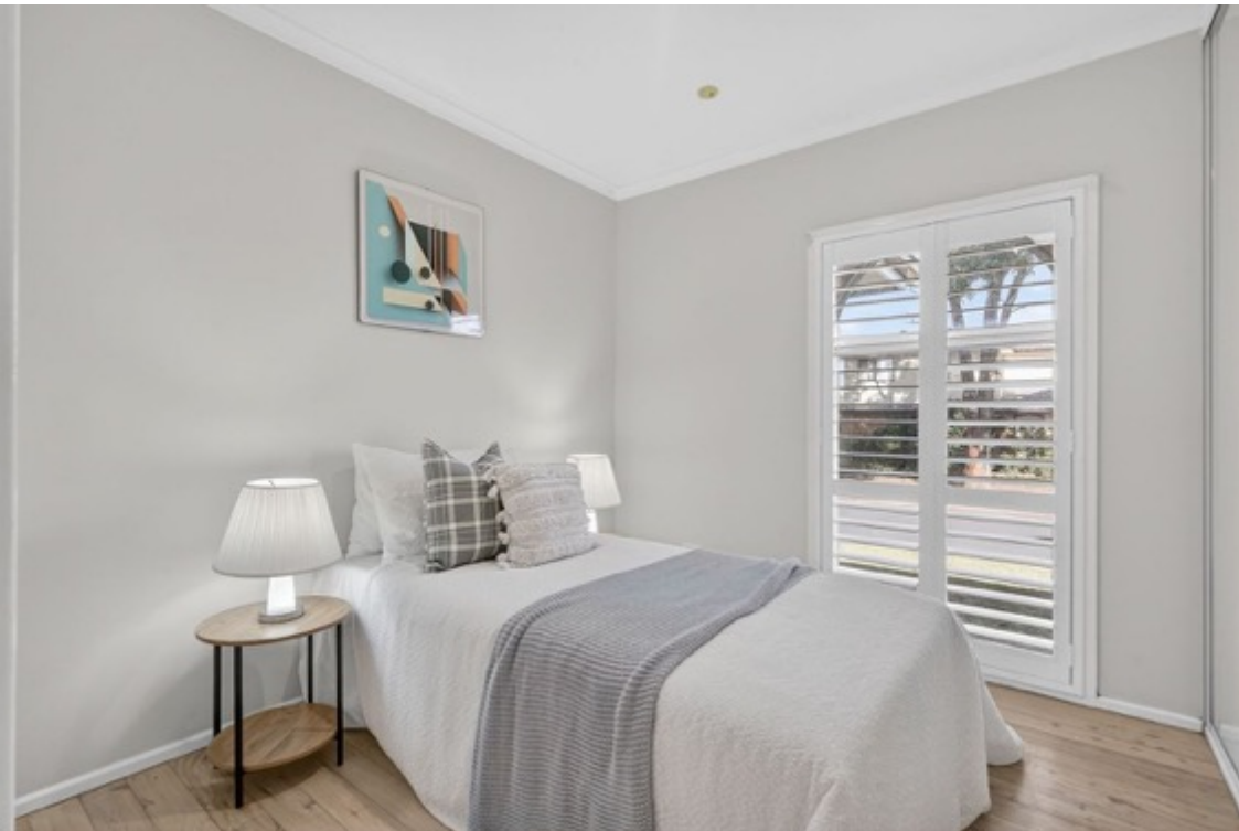
Example front mid section bedroom area above.