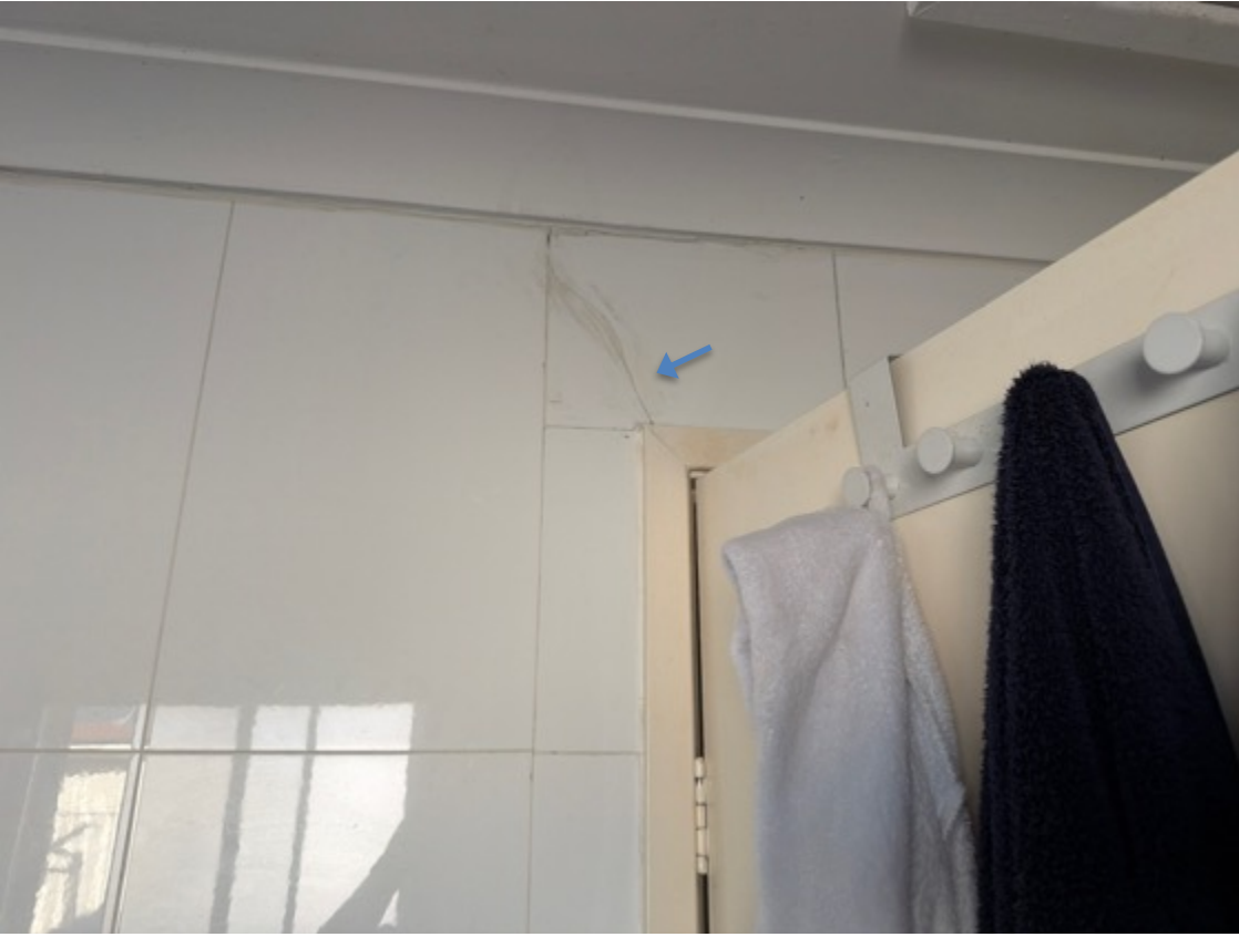
Isolated sections of tiles are cracked (example above the entry door.)