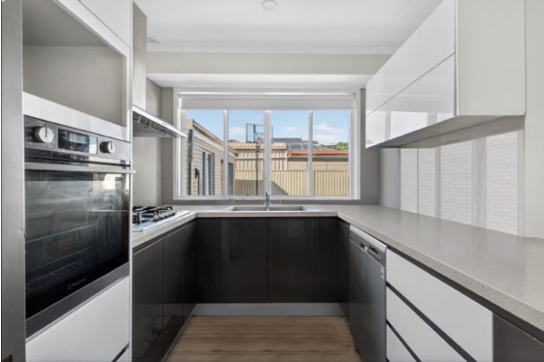
Appliances tested, functioned at the time of inspection.