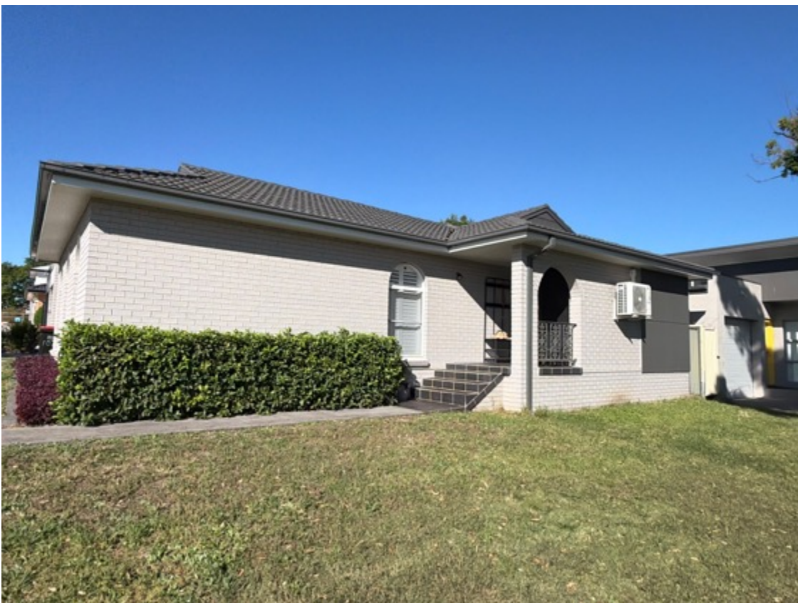
Exterior windows and doors present in satisfactory condition for the age.