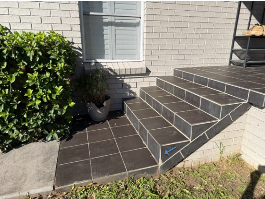
Isolated section of external tiles are cracked, consistent with age.