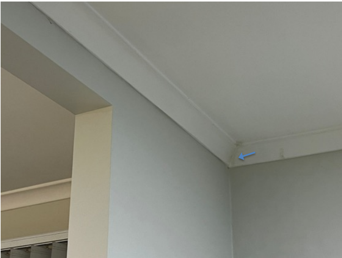
Plasterboard and cornices display hairline cracking.