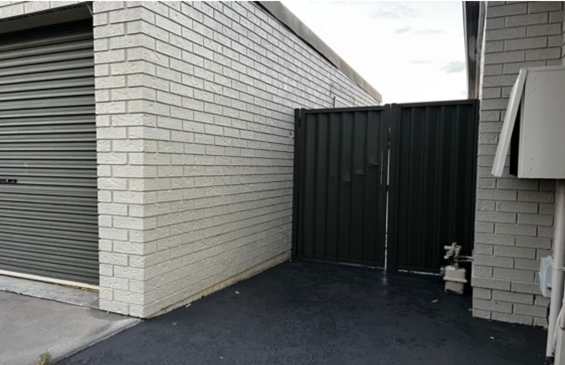
The garage roller door tested, functioned at the time of inspection - minor dents on roller doors, consistent with age.